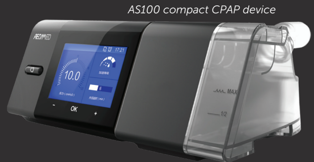
AS100 compact CPAP device

These high-quality, German-designed systems combine the Swiss-made Sensiron technology for the flow sensing and Motorola pressure sensing with a robust algorithm to produce a high-grade treatment device. For more information on availability and to request a demo, please contact your local BHC representative.